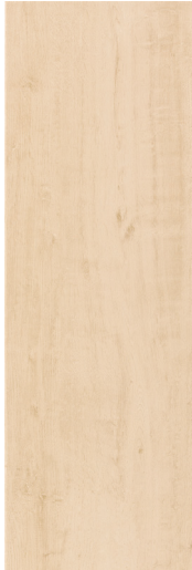
Branch Melawi 25x75,6 cm C-550