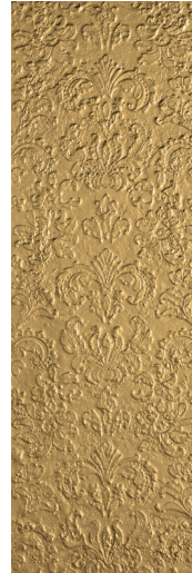
Reale Gold 25,1x75,6 cm C-357