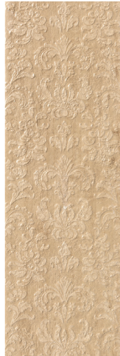
Branch Oak Reale 25x75,6 cm C-550