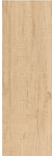
Branch Oak 25x75,6 cm C-550