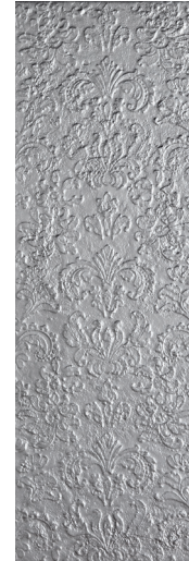
Reale Silver 25,1x75,6 cm C-357